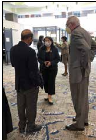
Attendees enjoyed the face-to-face interaction in the exhibit hall.